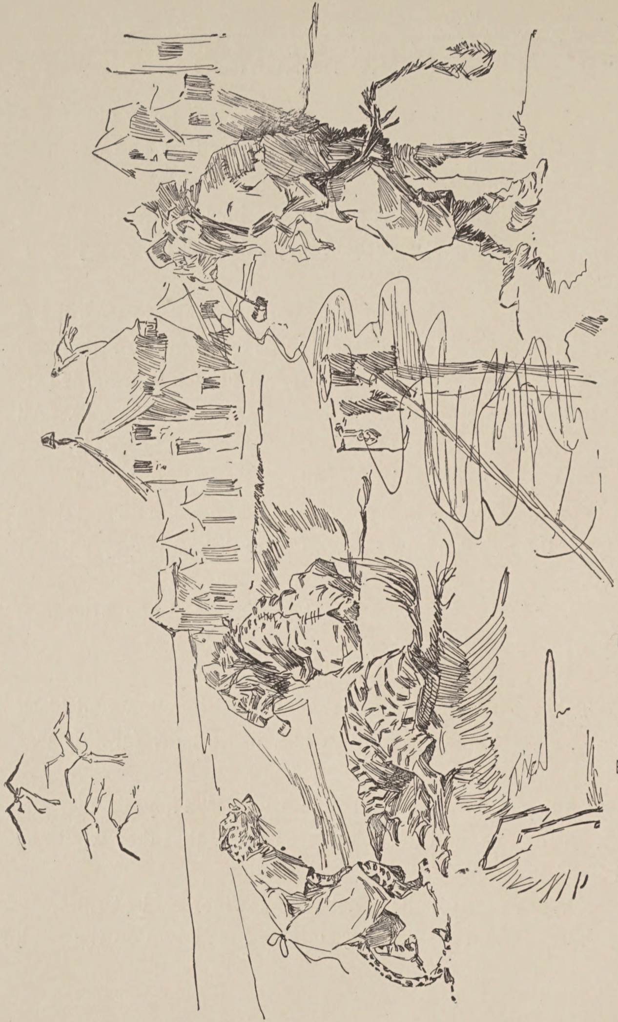
TIGER AND ZEBRA MAKE FUN OF LEOPARD'S SPOTS.